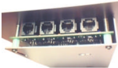
4 sensor ports on two sides

Easy assimilation into Category 2 (or better) structured wiring systems.