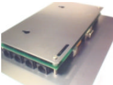
Hang or recess mount

Technical support response within 24 hours via telephone/email.