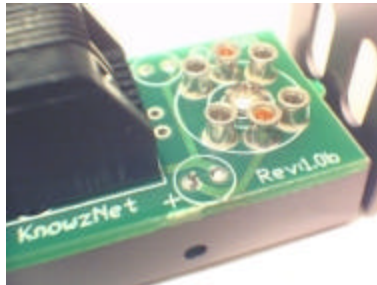
Sensor sockets for field replacement