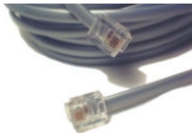
Hook-up with telephone cable