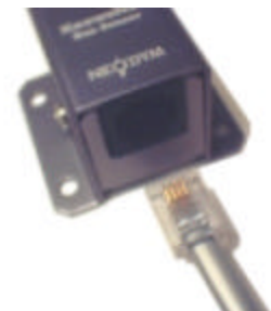
Connection is a "snap"