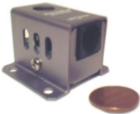
Sensor heads are small and unobtrusive

Simple or extended functionality operating modes.